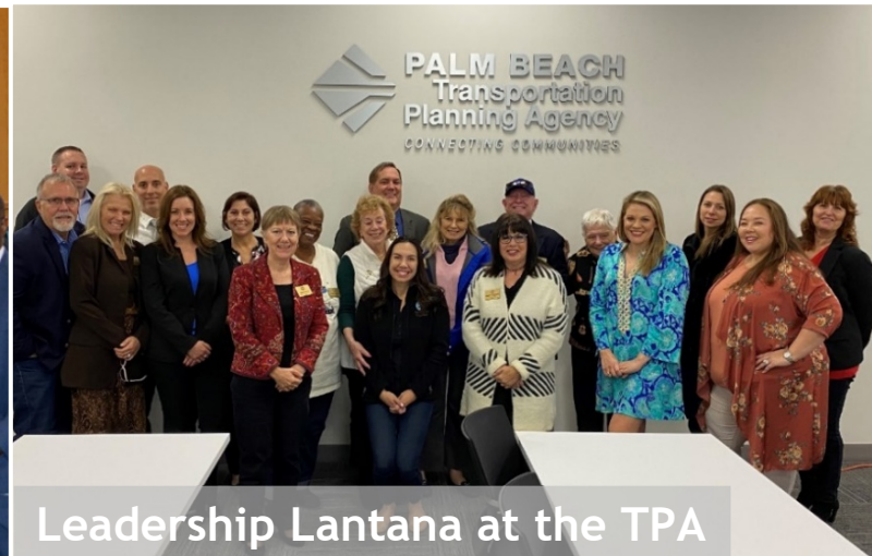
Leadership Lantana at the TPA