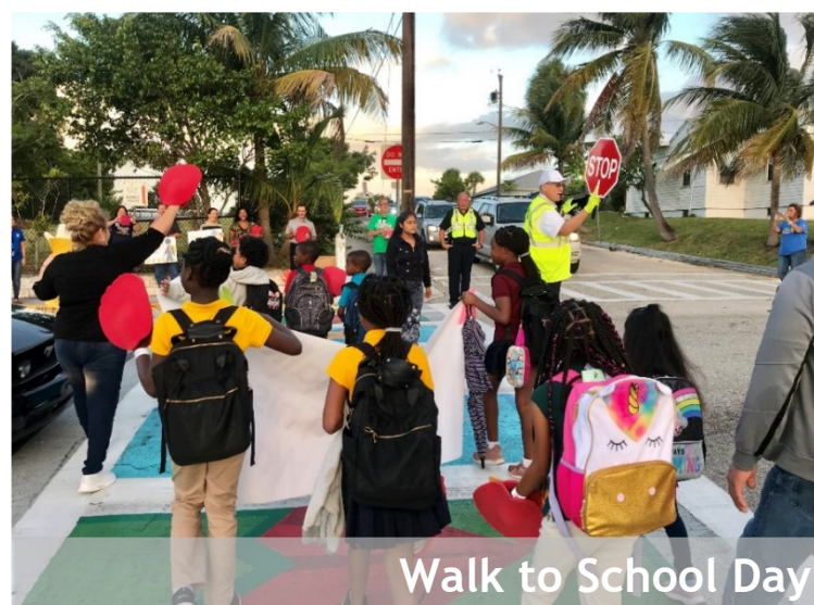
Walk to School Day - Lake Worth Beach