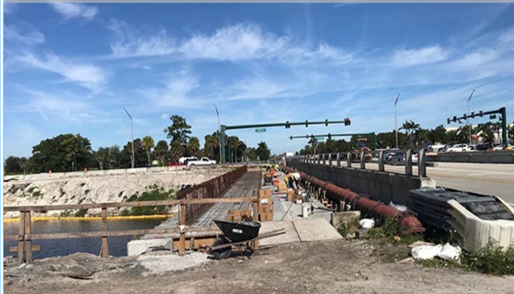
SR 80 at Lyons Rd/Sansbury Way