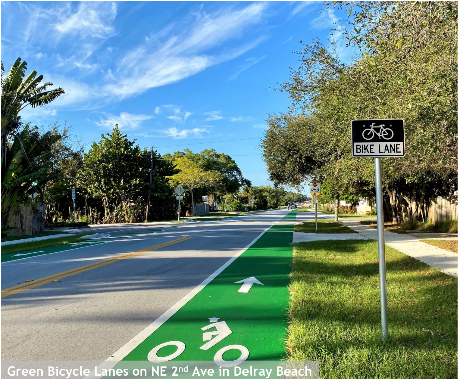
Green Bicycle Lanes on NE 2 nd Ave in Delray Beach