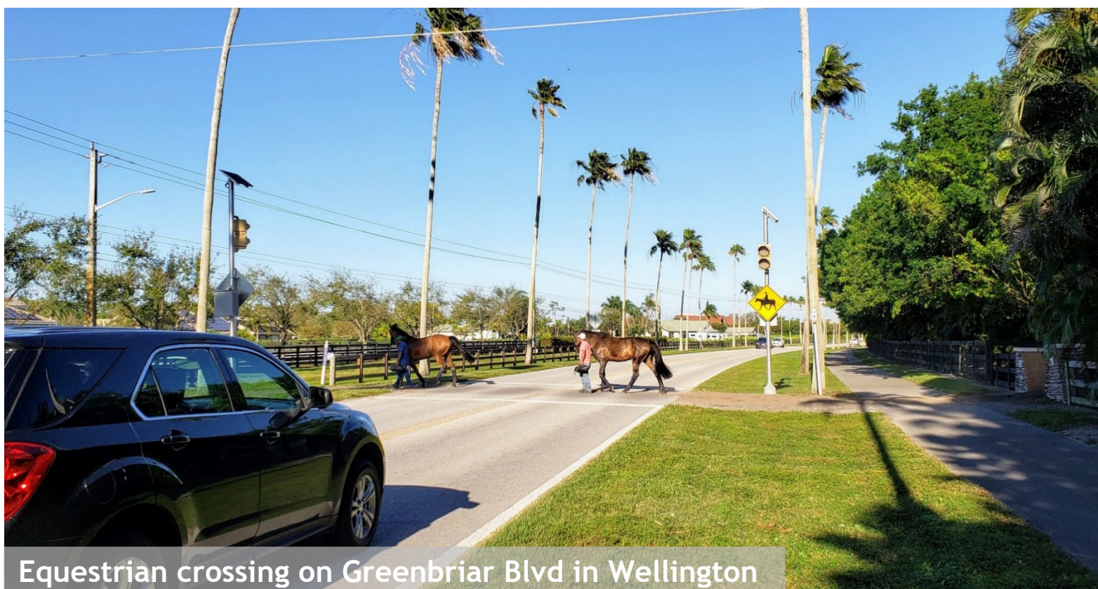
Equestrian crossing on Greenbriar Blvd in Wellington