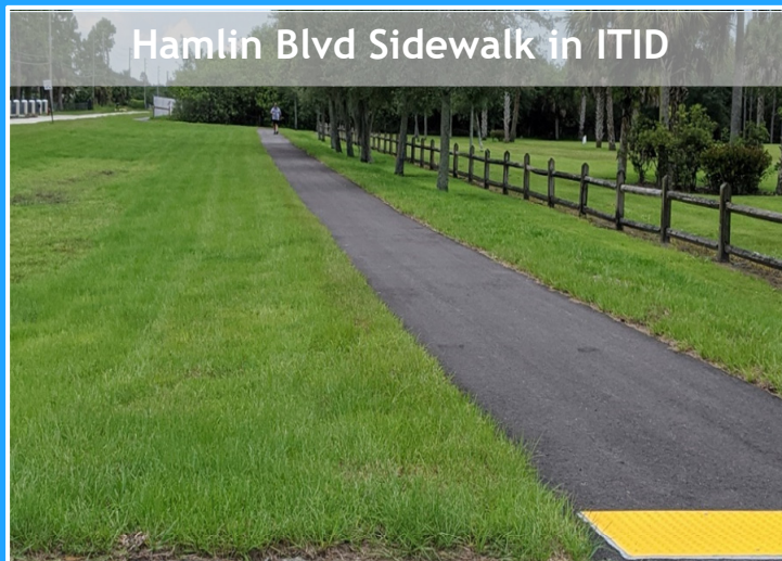
Hamlin Blvd Sidewalk in ITID