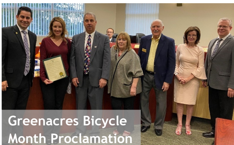
Greenacres Bicycle Month Proclamation

We are also planning for optimization of current conditions by developing better ways to share data via a Smart Palm Beach website.