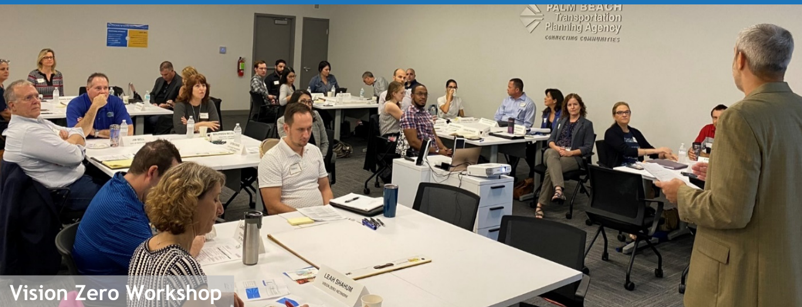
Vision Zero Workshop