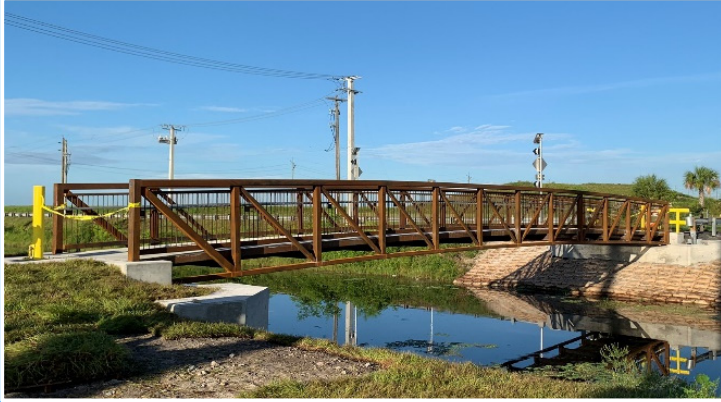
Binks Pointe Path in Wellington