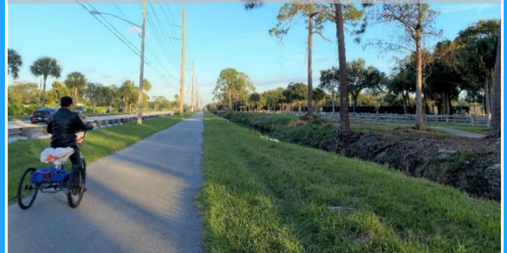
Shared Use Path on Palmetto Park Rd in Boca Raton