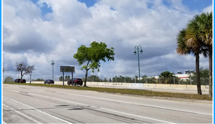
Congress Ave lighting in Riviera Beach