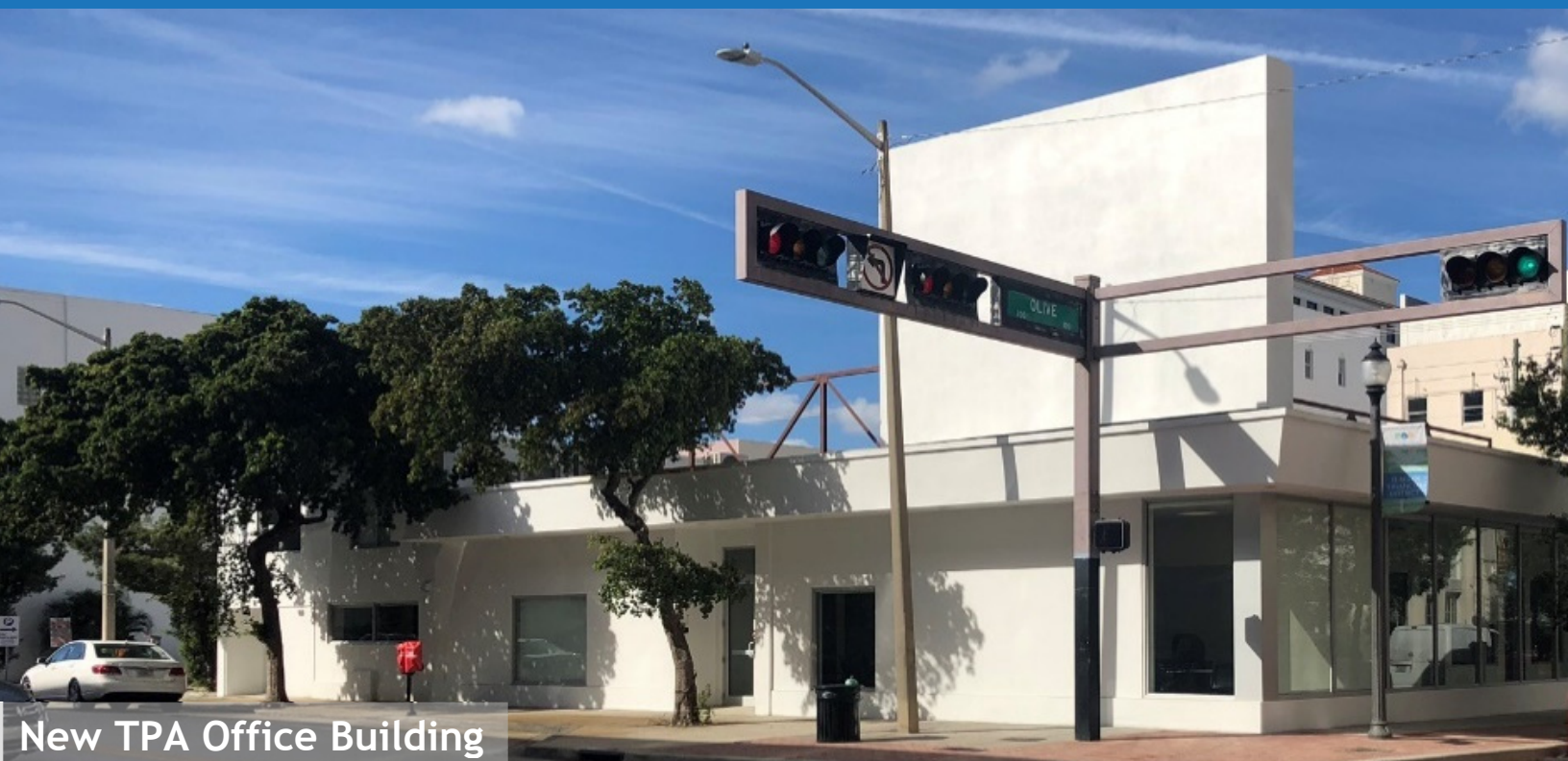
New TPA Office Building