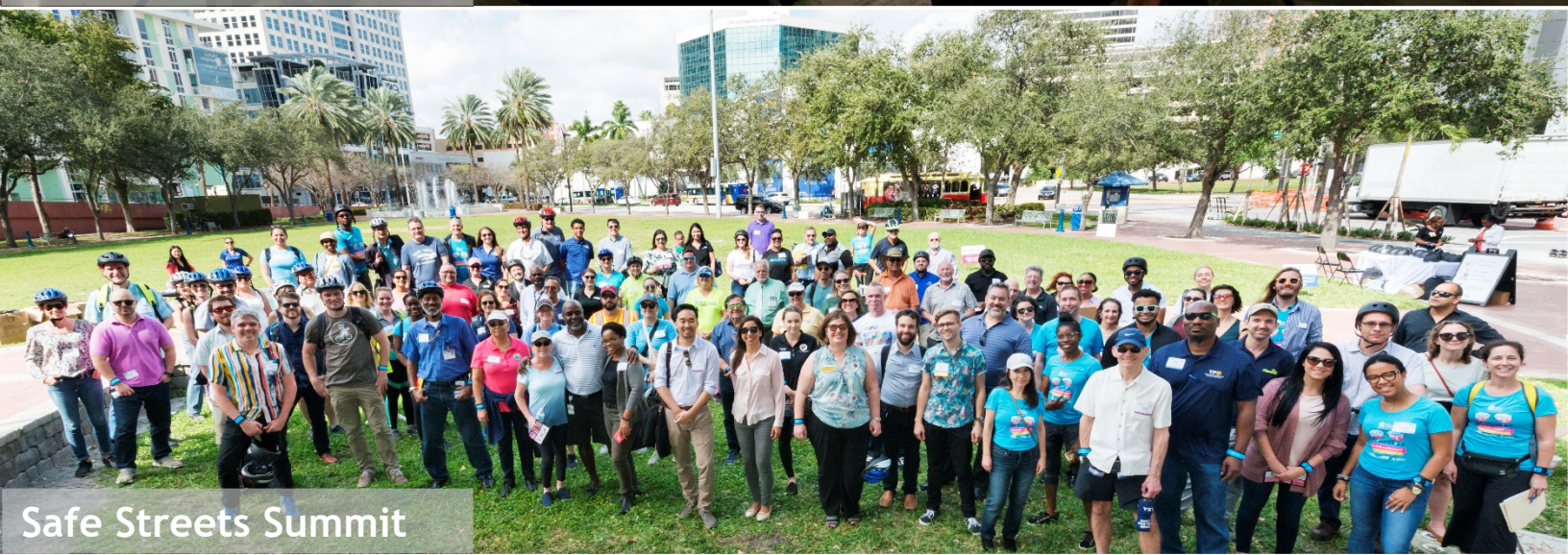
Safe Streets Summit