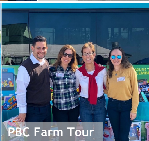
PBC Farm Tour