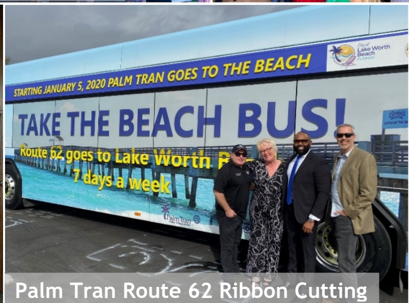
Palm Tran Route 62 Ribbon Cutting