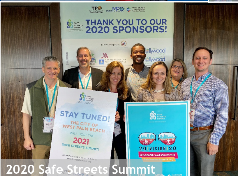
2020 Safe Streets Summit