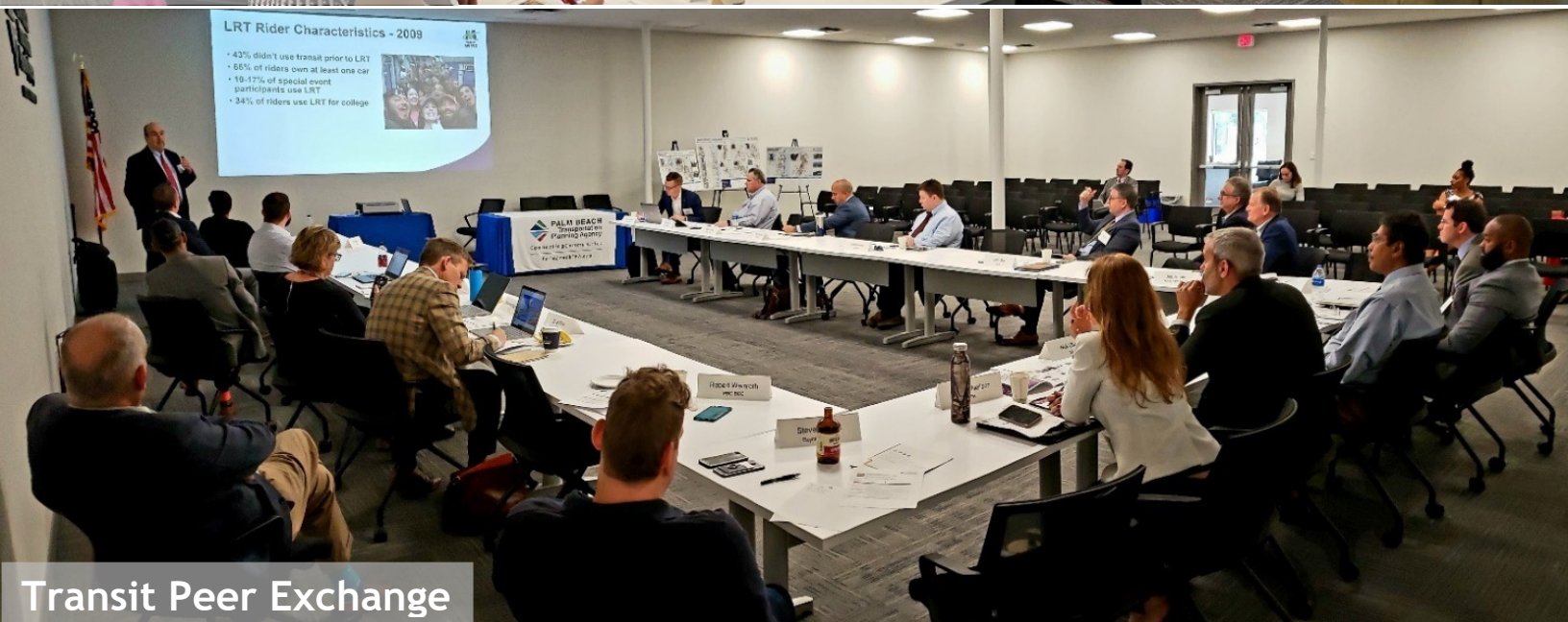
Transit Peer Exchange