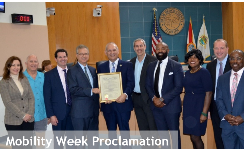
Mobility Week Proclamation

We coordinate and conduct workshops on topics of interest for our partners and stakeholders, encourage and facilitate designations for our municipalities, and continue to work with peer agencies.