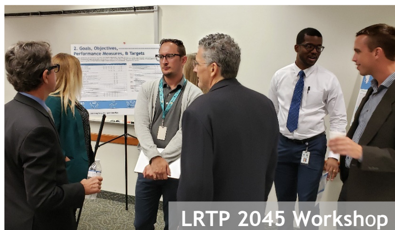
LRTP 2045 Workshop