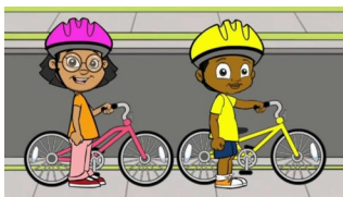
Bicyclist Safer Journey