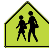
Florida School Crossing Guard Program