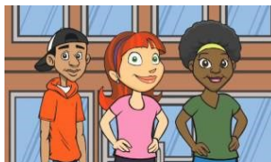
Pedestrian Safer Journey