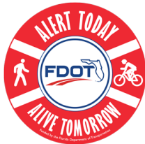
Alert Today Florida

Please take the time to visit some of our partners.