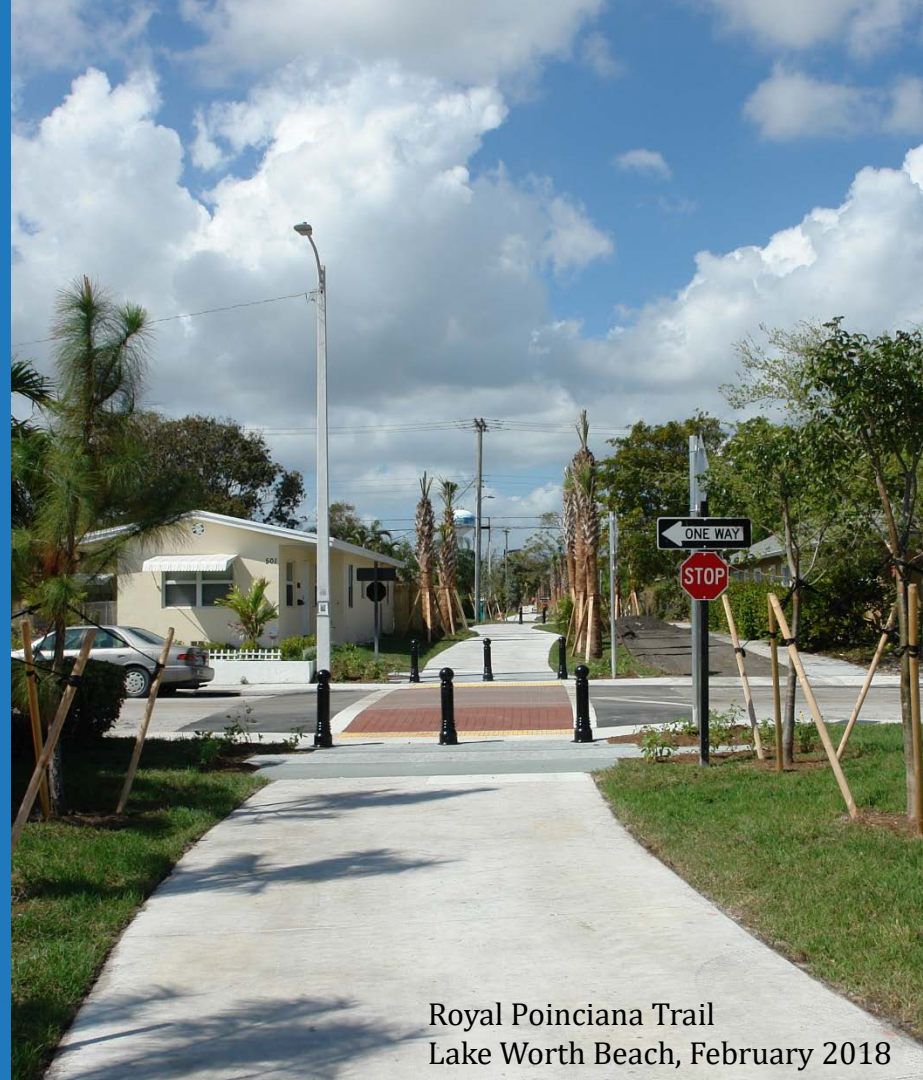
Royal Poinciana Trail Lake Worth Beach, February 2018

To collaboratively plan, prioritize, and fund the transportation system.