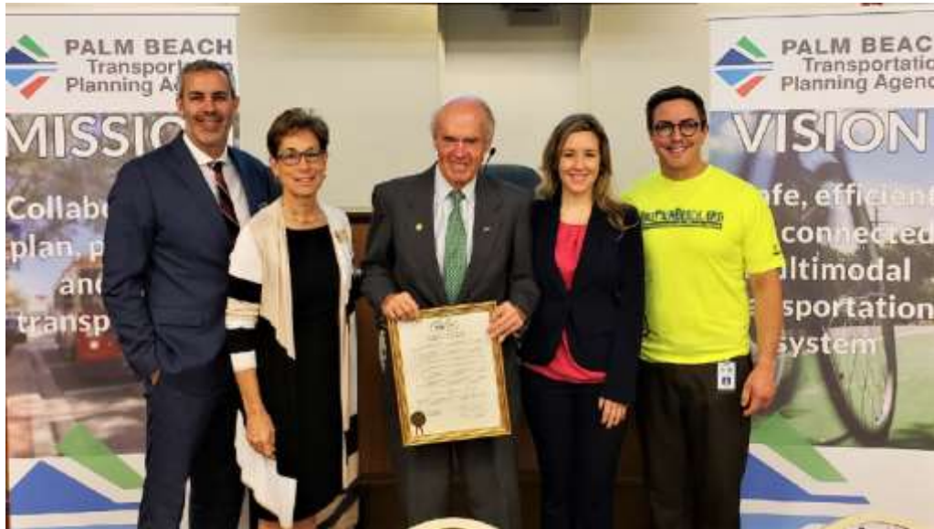
Board Members and Officers