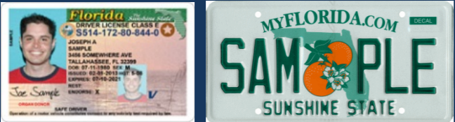
Motor Vehicle License, Title, Registration Fees