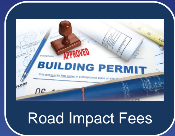
Road Impact Fees