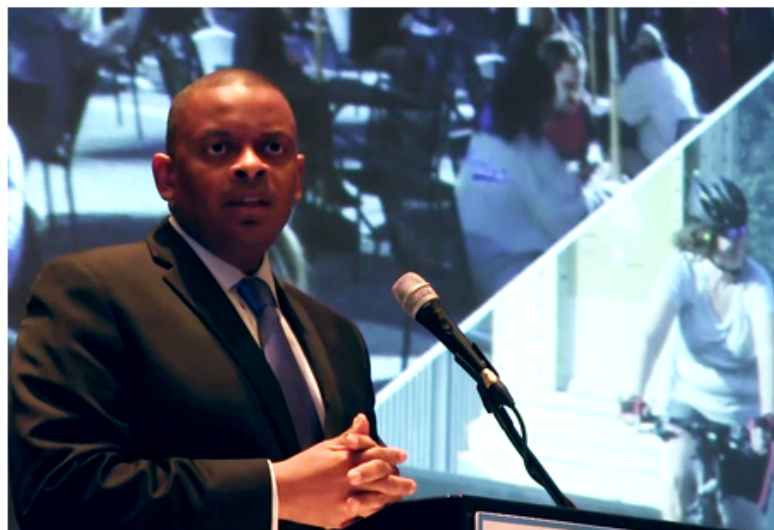
Photo Caption: U.S. Transportation Secretary Anthony Foxx at the 2014 Pro Walk, Pro Bike, Pro Place Conference

Secretary Foxx is challenging mayors and local elected officials to take significant action to improve safety for bicycle riders and pedestrians of all ages and abilities over the next year. Mayors' Challenge participants will be invited to attend the Mayors' Summit for Safer People, Safer Streets in March, and their cities will spend a year helping their communities undertake seven activities to improve safety. The challenge is based on the 2010 USDOT Policy Statement on Bicycle and Pedestrian Accommodation.