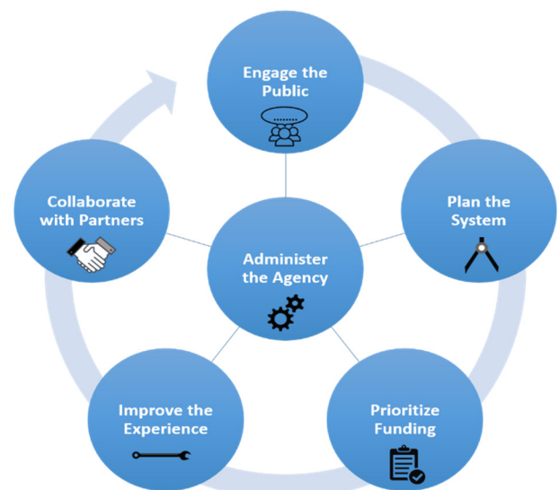
Figure 1: Six Goal Areas from the MPOs Unified Planning Work Program

Since that time, the consultant team, working with MPO staff, have drafted goals and supporting objectives, activities, measures, and targets for each goal (summarized on the following pages). Input is being sought on these draft items and will be considered in the final strategic plan.