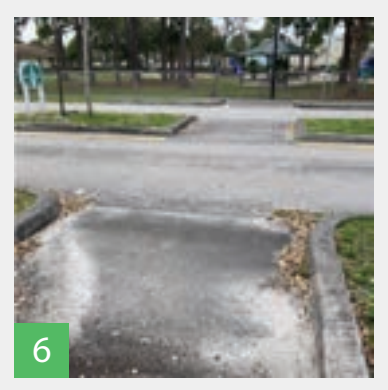
Mark crosswalk and add detectable warnings