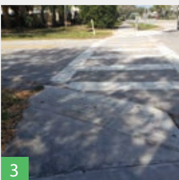
Replace existing detectable warnings