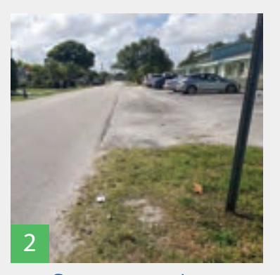
Construct continuous sidewalk network