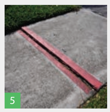
Replace broken and lifted segments of sidewalk