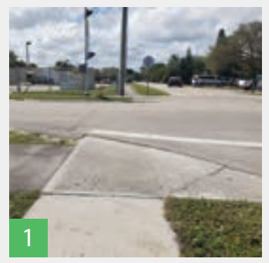
Mark high visibility crosswalk with detectable warnings