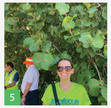
Maintain overgrown landscaping