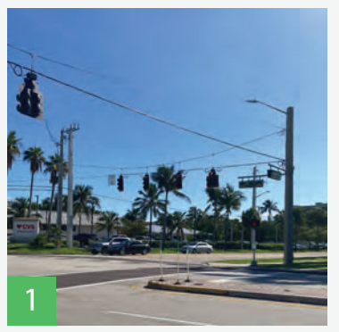
Replace missing "No U-Turn" signage