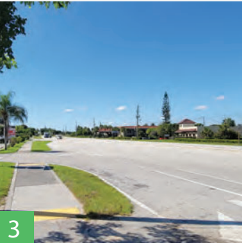
Evaluate feasibility of new pedestrian crossing