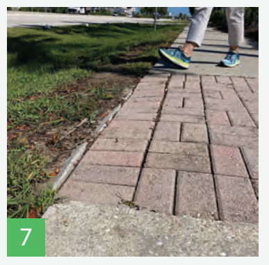
Replace raised brick pavers to make sidewalk flat

See interactive map of walking audit and findings at: PalmBeachTPA.org/WalkBikeAudits For more information, contact Alyssa Frank: AFrank@PalmBeachTPA.org or (561) 725-0806