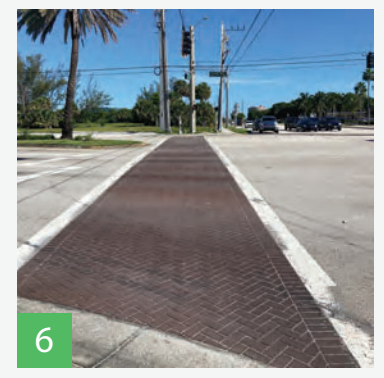
Extend median to create a pedestrian refuge island