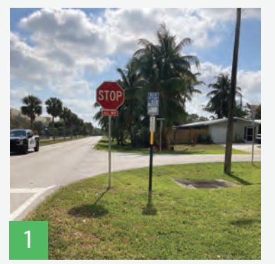
Relocate bus stop and make it ADA Compliant