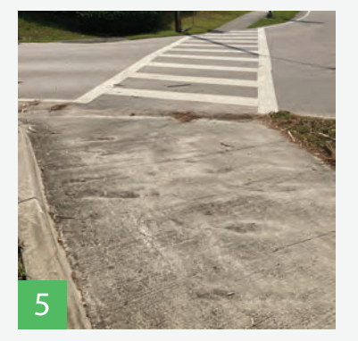
Reconstruct pathway to be ADA Compliant