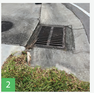
Address grade issues with stormwater inlets