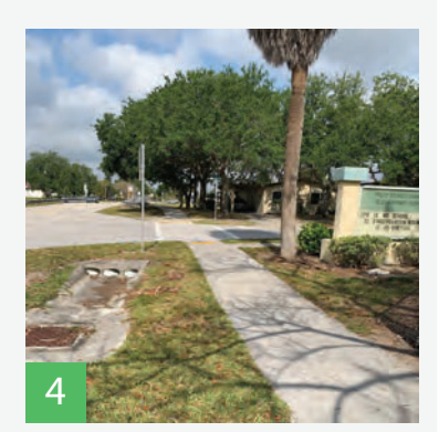
Widen sidewalk to shared use path