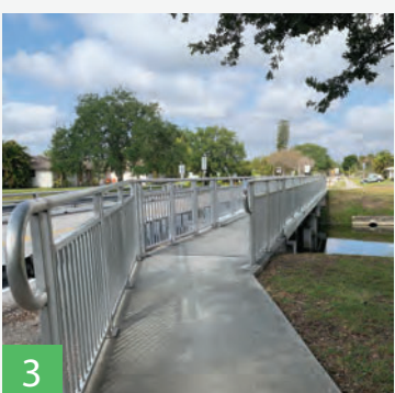
Install pedestrian scale lighting along bridge