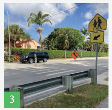
Add Rectangular Rapid Flashing Beacon (RRFB)