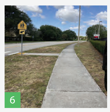
Widen sidewalk to shared use path