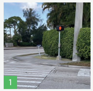
Upgrade pedestrian signal head to have a countdown