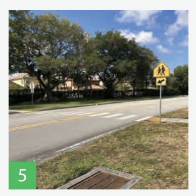
Add Rectanggular Rapid Flashing Beacon (RRFB)