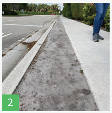
Widen sidewalk to shared use path or plant grass